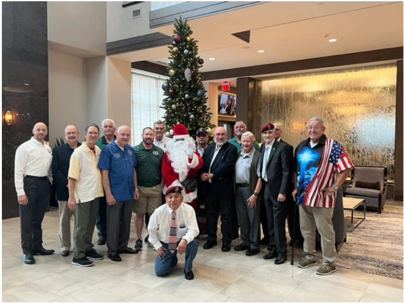
Texas Lone Star Chapter Members at the Chapter Christmas Party