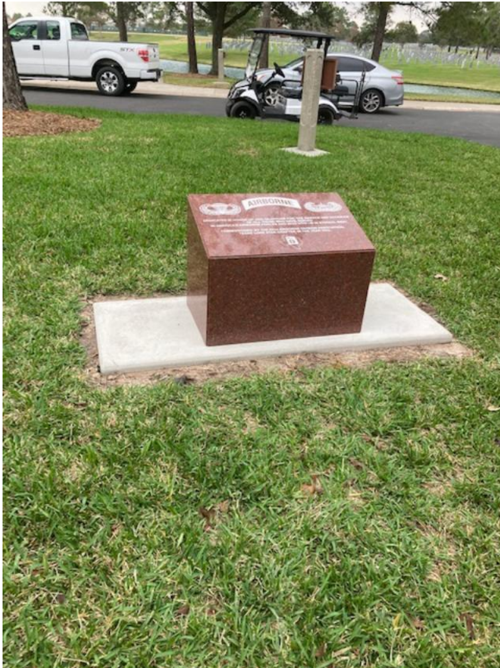
Chapter Monument in Houston Veteran Cemetery